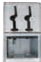
Prep for Coin ("X")